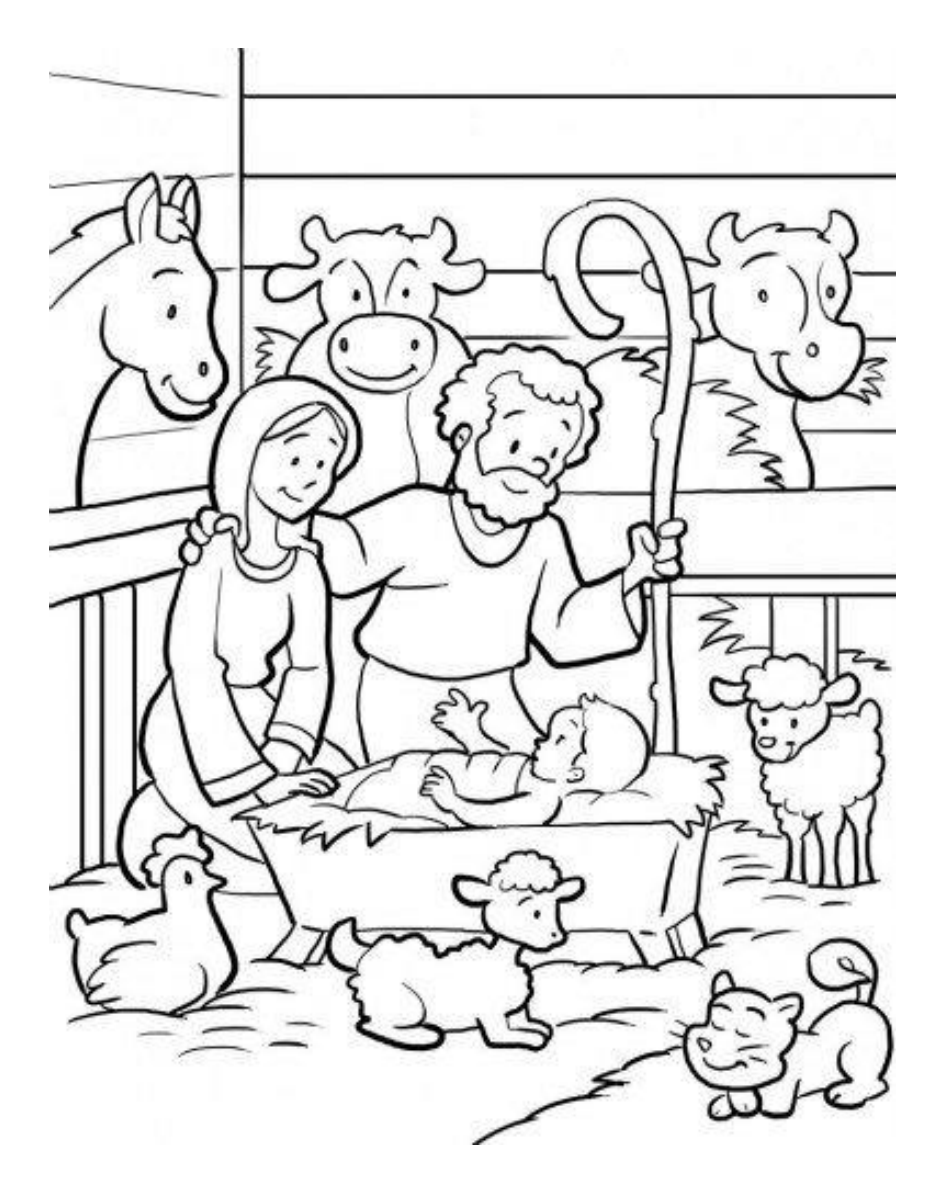
You might like to colour in the pictures during the service, or when you get home.